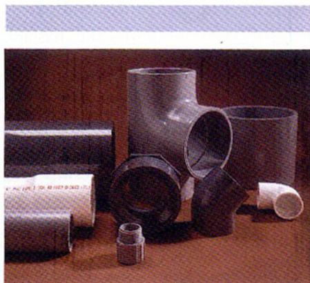
When testing your PVC and CPVC pipe and fittings installations, water testing is a safer and more reliable method than air testing.

Air is a compressible gas that can store far more energy than water when put under pressure because it can release this energy so rapidly. This raises the possibility of an explosion. The most common cause of failure is to employ too much air pressure, which can result in an explosion. Other testing mistakes that can cause failures are: