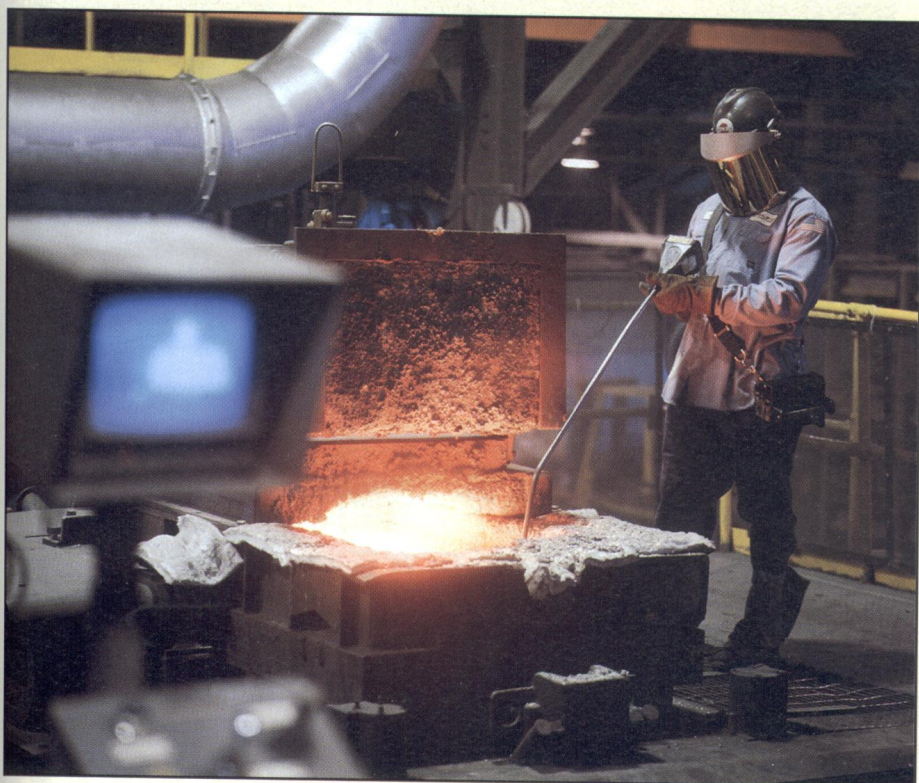
Left: Our Disamatic Molding Machines produce high-volume, world class castings; Below: Foundry employees continuously monitor the temperature and chemical composition of the iron in our cupola; Bottom: With more than 625,000 square feet of modern warehouse space, Charlotte Pipe is able to fill and ship orders with short lead times.