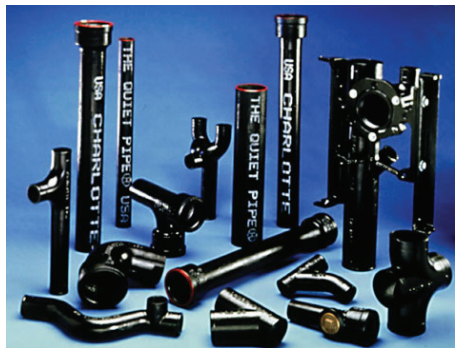
Charlotte Pipe’s cast iron pipe and fittings are twice as quiet as an all-plastic system and can improve the indoor environmental quality of buildings and homes by reducing water noise.

ReUze is listed with NSF International and bears the mark “NSF-rw”. It meets all of the same require-