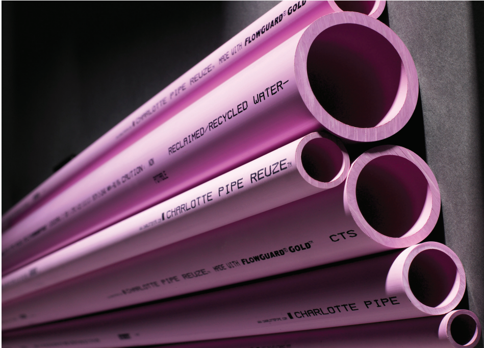
ReUze® from Charlotte Pipe is a complete CPVC CTS piping system for the distribution of reclaimed water, rainwater and gray water.

Building Industry. One example is the U.S. Green Building Council's (USGBC) LEED for Schools rating system announced in December 2007, which references to ANSI S12.60-2002 and offers as many as two points for noise control in K-12 school buildings. In addition, some counties have included a section in the healthy indoor environments section of their Green Building Guidelines regarding noise pollution.