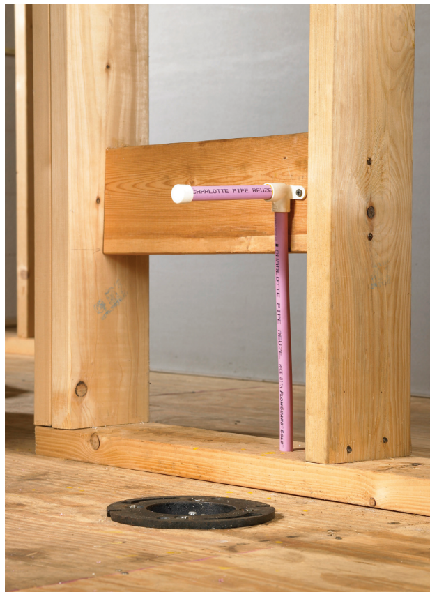
ReUze pipe helps utilize non-potable, reclaimed water for applications such as toilet and urinal flushing.

Cast iron and its noise abatement quality is also an asset to indoor environmental quality, or IEQ. IEQ is one of the criteria of the USGBC’s