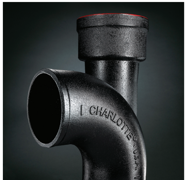
Cast iron pipe and fittings from Charlotte Pipe are made from 100% recycled scrap iron.

Charlotte Pipe is also embracing the use of non-potable water indoors with its newest product offering, ReUze®. Non-potable water sources include