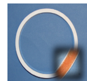
Cellular core of PVC stained orange for identification