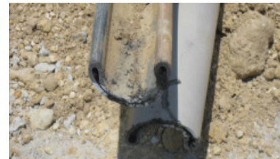
Buried pipe collapsed due to exposure to excessive temperatures