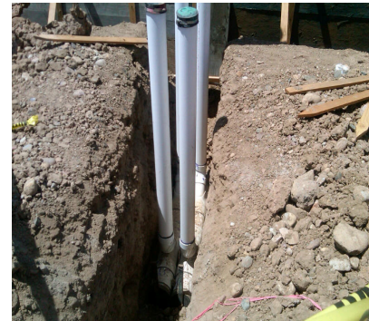
Trench width is too narrow, two pipes buried directly adjacent to one another and improper bedding